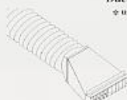
End Diffuser on duct